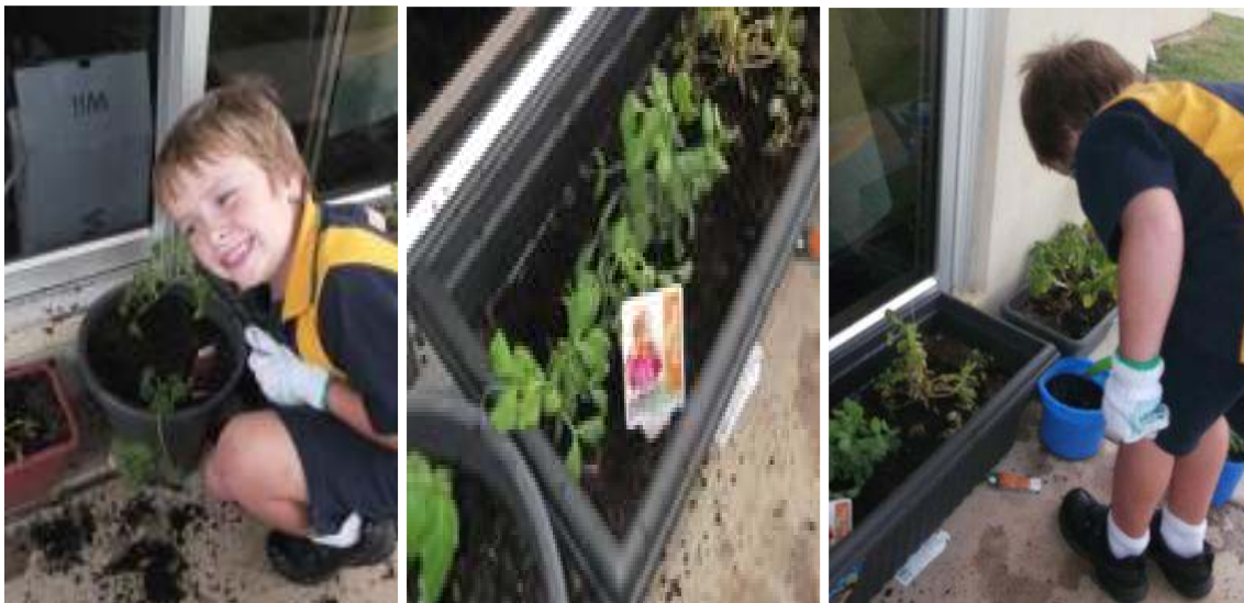
Our garden project continues to grow with the inclusion of some tomatoes for our spaghetti and sugar snap peas to add to our afternoon tea deliciousness!